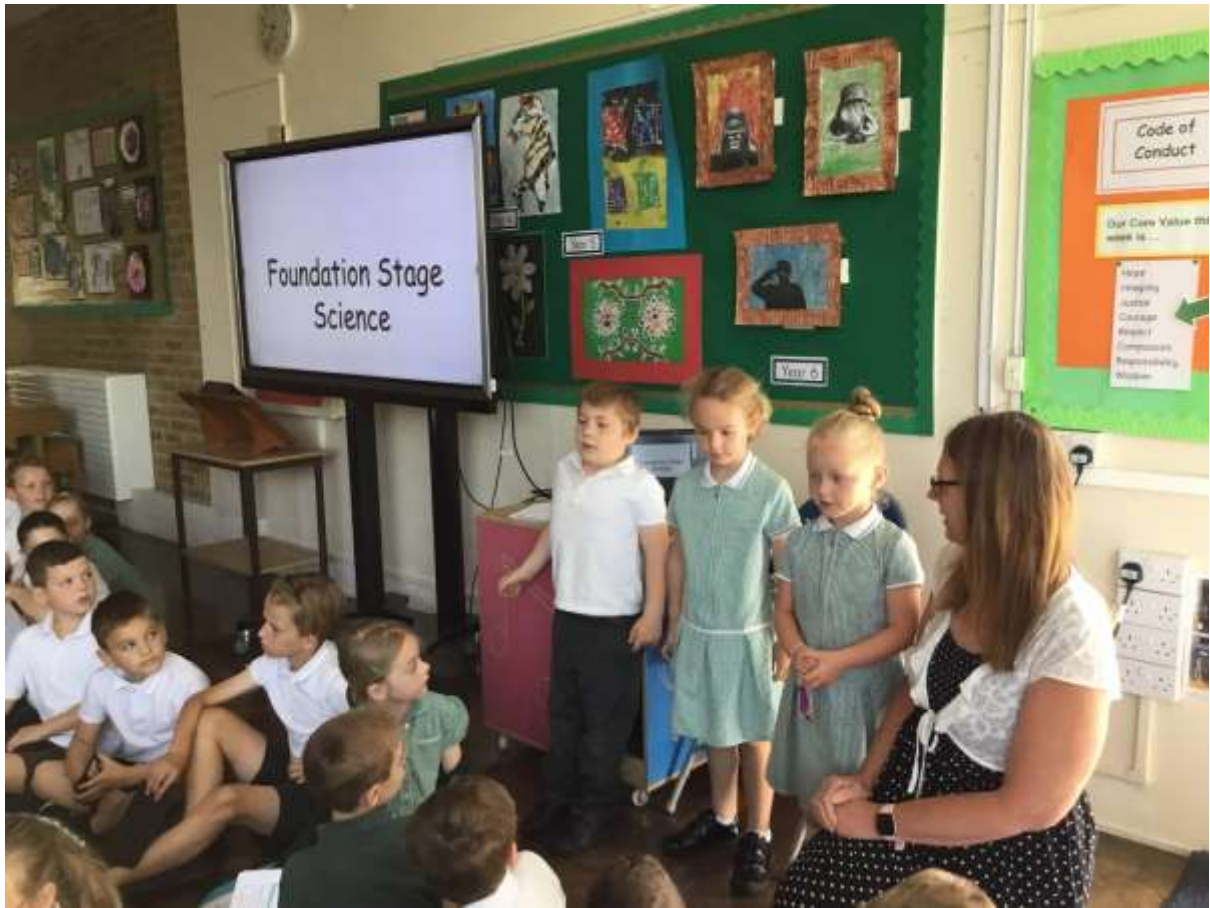
Presenting their work in a whole school assembly